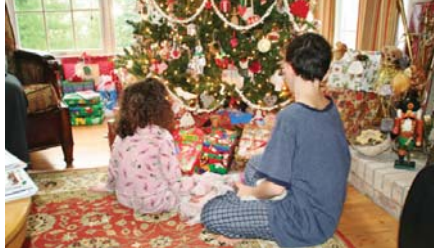
Holiday traditions are fun. This year it may be time to begin some new ones to add more enjoyment.