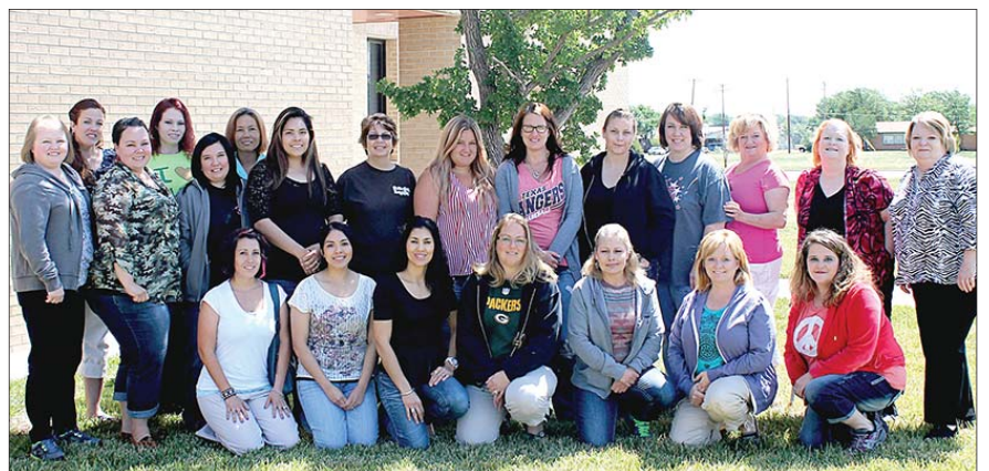
Clarendon College's first class of students working on their Associate of Nursing Degree.