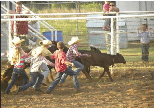
After him! Kids participate in the COEA Calf Scramble last Thursday.