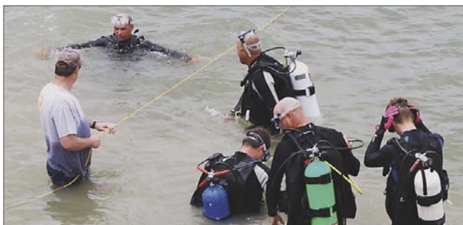
Members of the Clarendon Volunteer Fire Department Dive Team prepare to search for the body of a young man who drowned at Lake Greenbelt Sunday afternoon.

To date no one has drowned while wearing a lifejacket.