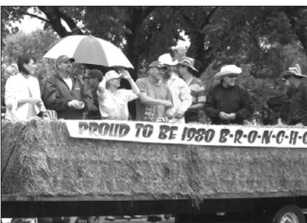
CHS Class of 1980 Float.