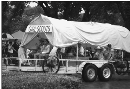
Clarendon Girl Scouts Float.