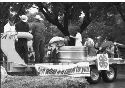
Donley County 4-H Club Float