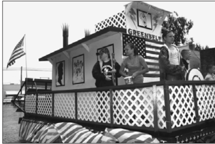
Best Float: Greenbelt Electric Coop.