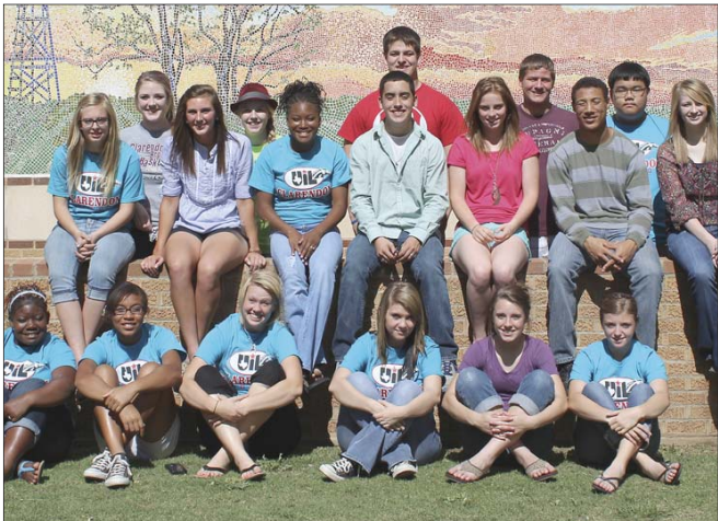
Clarendon High School's 2012 Regional Academic Team