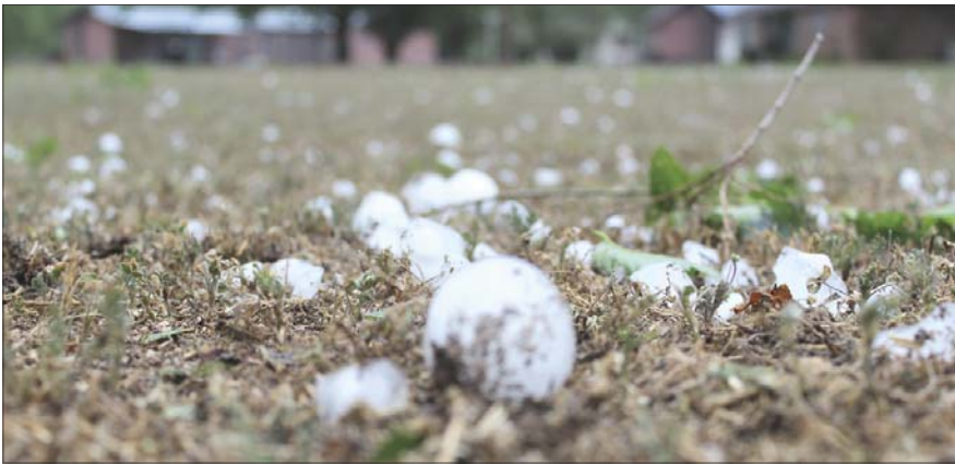
Hail litters a yard at a residence in Lelia Lake.

RFO graduation will continue to be at 1:30 p.m. with a reception immediately following in the Harned Sisters Fine Arts Center lobby.