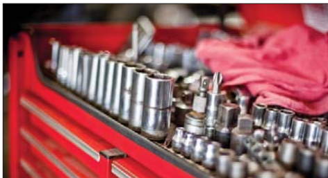
Some new tools might make the perfect holiday gift for the auto aficionado in your family.

Auto aficionados love working on their vehicles, and that work can't be done without the right tools. If possible, visit his or her garage or shop and peruse the tool collection. If anything looks especially aged or ragged, replace it with a newer version. Auto lovers are often particular about their tools, so if you're reticent about buying new ones, take your gift recipient to the store and let him or her choose a gift or buy a gift certificate that covers the cost of the tools that look like they need replacing.