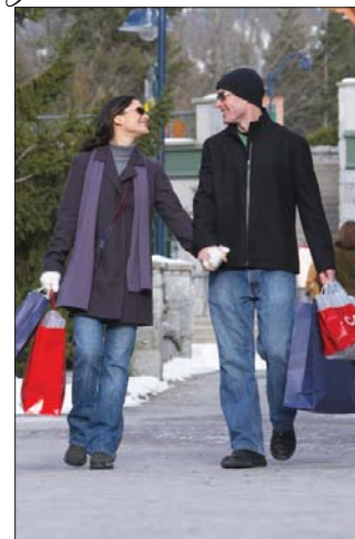
Holiday shopping doesn't have to break the bank.

* Pay in cash. If you're not a fan of online shopping, then use only cash when shopping at brick-and-mortar stores. Paying with cash eliminates the risk of overspending with credit cards, which will