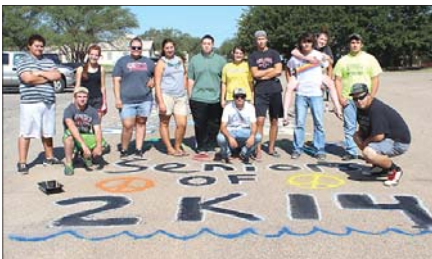
Tattooing the town, Hedley seniors spend the morning painting the street in front of the school.