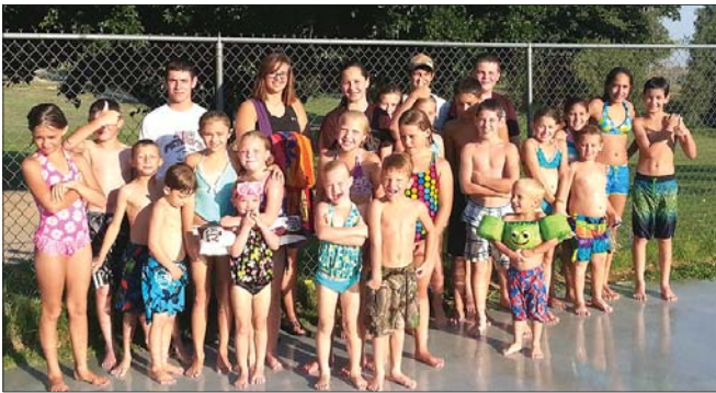
On Wednesday, August 21 The Donley County 4H Club held it's Sign-Up Party at the Clarendon Country Club.