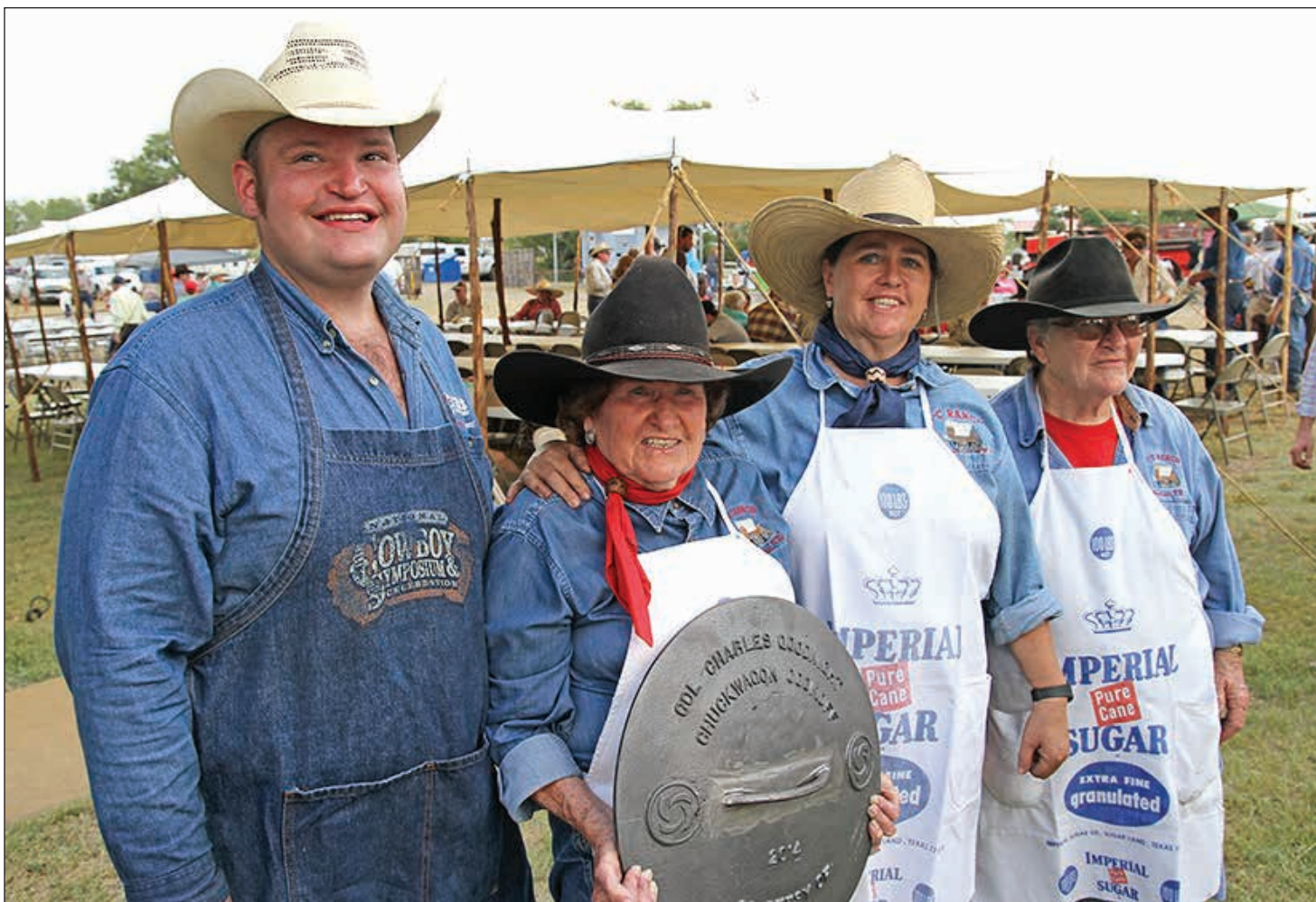
Members of the C Bar C Chuckwagon Team from Hartley show off the lid to their championship bean pot after winning the 20th annual Col. Charles Goodnight Chuckwagon Cookoff last Saturday, September 27.

The Texas Department of State Health Services will hold an Immunization Clinic at the Burton Memorial Library Thursday, October 9, from 10 a.m. to 2 p.m. All clinic times subject to change or cancellation in case of extenuating circumstances.