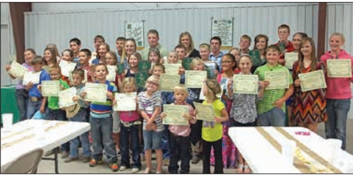
All the 4-H members that were present at banquet received their year pins and certificates.