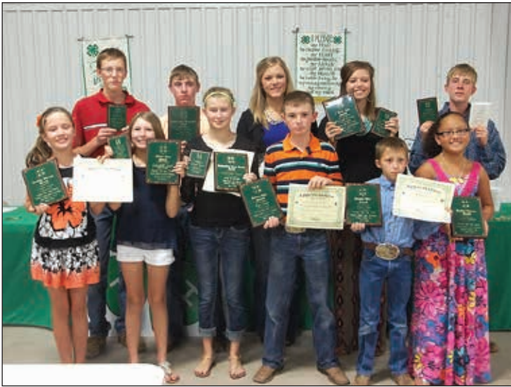
Award winners at the Annual Donley County 4H Awards Banquet on September 23.