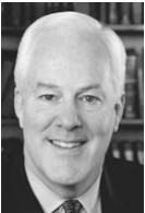
texas times by sen. john cornyn

For ten years, the Republic thrived on the same ideals that still drive our state: freedom, personal responsibility, and plain old hard work. On December 29, 1845, Texas became the 28th state