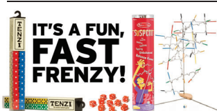
GAMES FOR ALL AGES