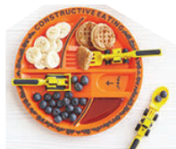
MAKE EATING FUN! CONSTRUCTIVE EATING DISH SET