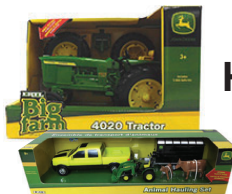
JOHN DEERE 4020 TRACTOR & ANIMAL HAULING SET