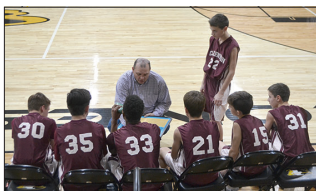
Clarendon Colts take a timeout as they sweep over Memphis, Thursday, January 10th.