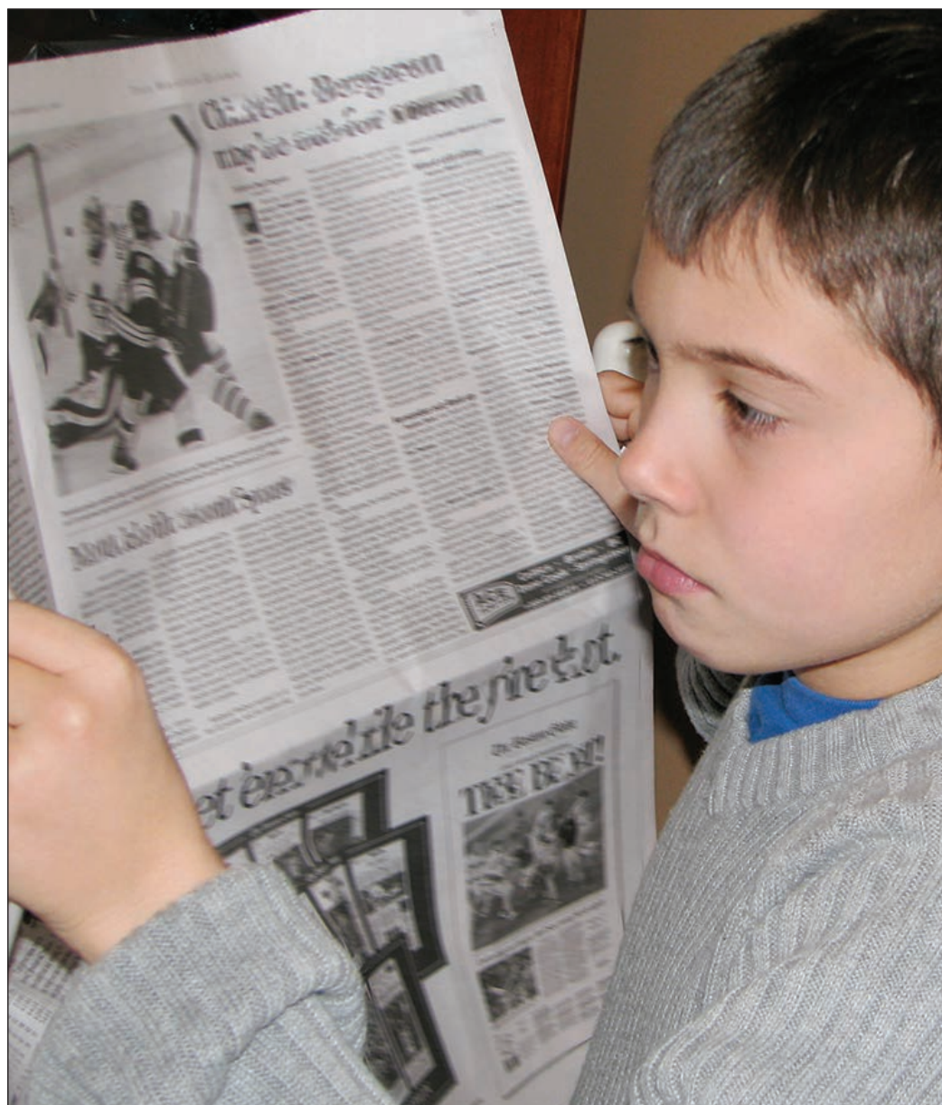
Newspapers remain invaluable resources that can benefit students in myriad ways.

5. Newspapers build global awareness. Customized newsfeeds funneled through social media outlets can make it hard for young people to recognize and understand the world beyond their own communities and interests. Each day, newspapers include local, national and