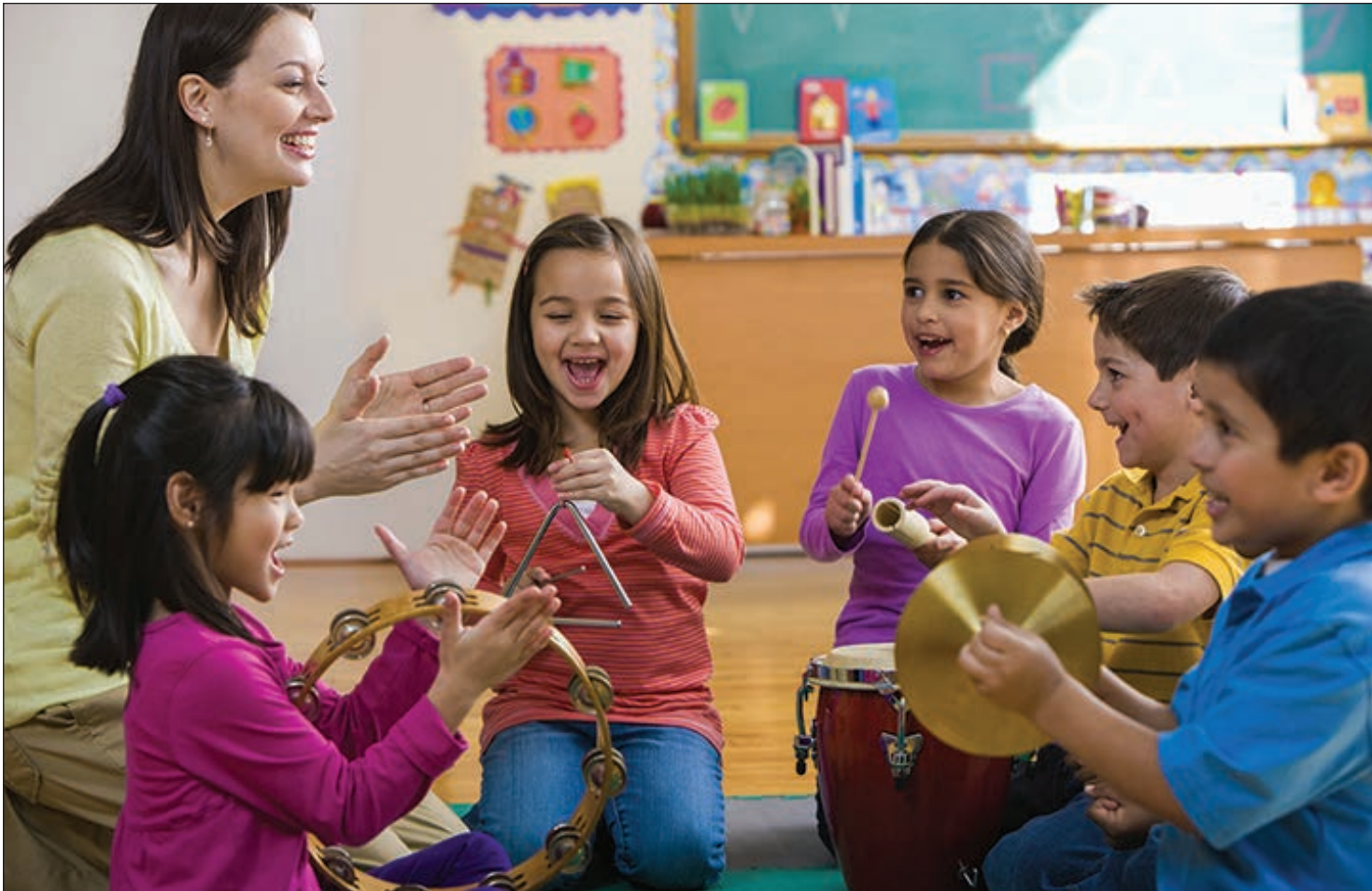
Parents can take various steps to make the transition back to school a successful one for their young students.

• Encourage children to read throughout the summer. A report from the education publishing company Scholastic found that 47 percent of parents are unaware of the "summer slide," which refers to the loss of academic skills that occurs when school