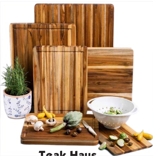
Teak Haus Charcuterie & Cutting Boards