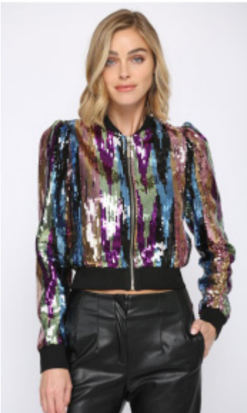
Fashionable Clothing, Scarfs, & Jewelry

Your Holiday Gift Headquarters Clothing, Jewelry, Housewares, Toys & More!