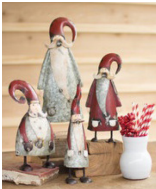
Christmas Home Decor