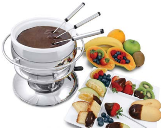
Stainless Steel Fondue Sets