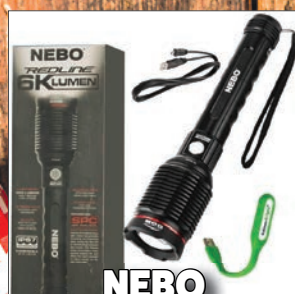
NEBO 6K Power Light