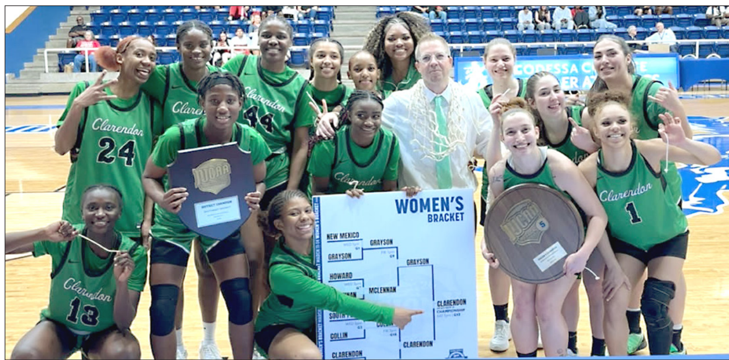
The 2026 NJCAA Region V Champion Lady Bulldogs.