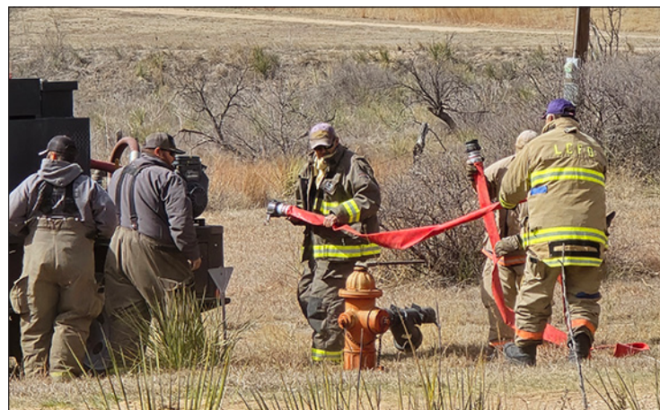
Top Photo: Fire crews battle the Corner Pocket Fire west of Kincaid Park Sunday. Bottom Photo: Howardwick and Mobeetie crews work to refill fire trucks after a separate fire in Howardwick's Saints' Roost Addition.