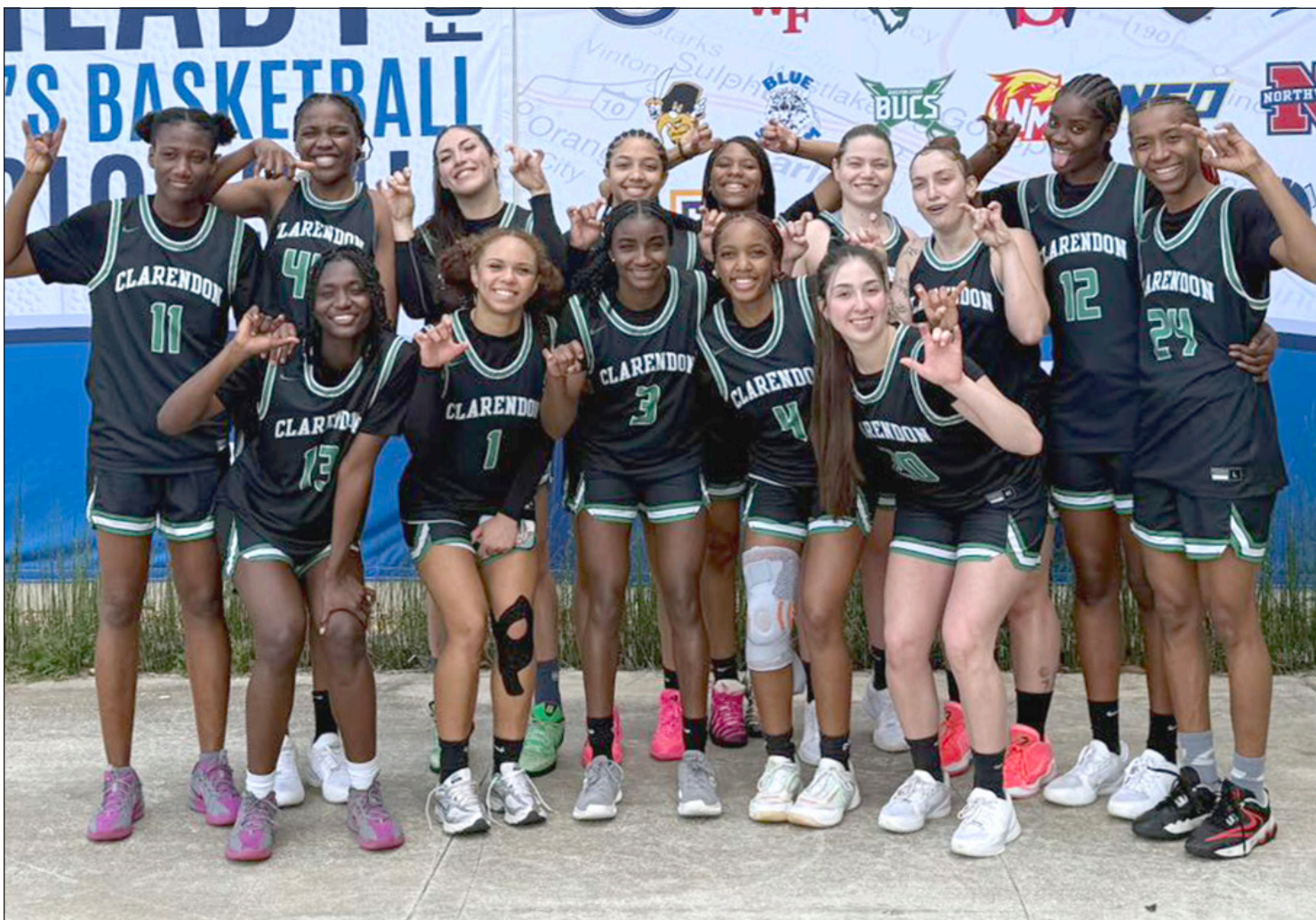
The Clarendon College Lady Bulldogs arrived in Lake Charles this week to start warming up for the NJCAA tournament. They will play their first game of the tournament this Friday at 2:30 p.m. The game will be streamed on ESPN+.

Going into the Division I national tournament, the Lady Bulldogs have an overall record of 31-2 this season.