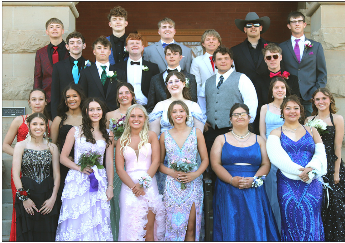
In Style Clarendon High School juniors gather on the steps of the 1890 Donley County Courthouse after the annual promenade before the Junior-Senior Prom last Saturday evening.