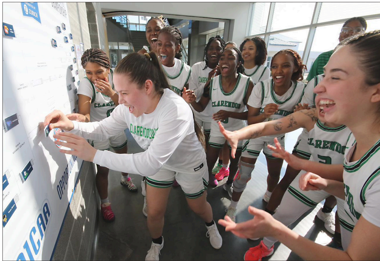
The Clarendon College Lady Bulldogs celebrate as they take their place in the Final Four bracket at the NJCAA tournament in Lake Charles last Saturday.