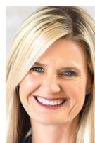
texas rural reporter by suzanne bellsnyder

This is what we should always have watchful eyes upon. In rural communities, we feel that shift faster than most. When the government expands beyond its role, it drains local resources with unfunded mandates and nonsensical demands. It brings distance, complexity, and decisions made