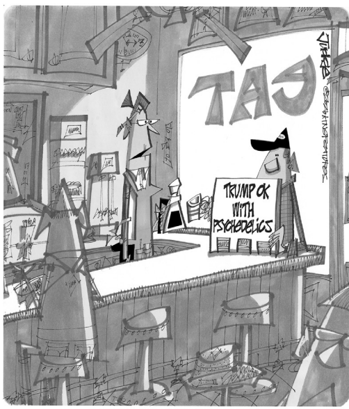
"Well, THAT explains a lot."