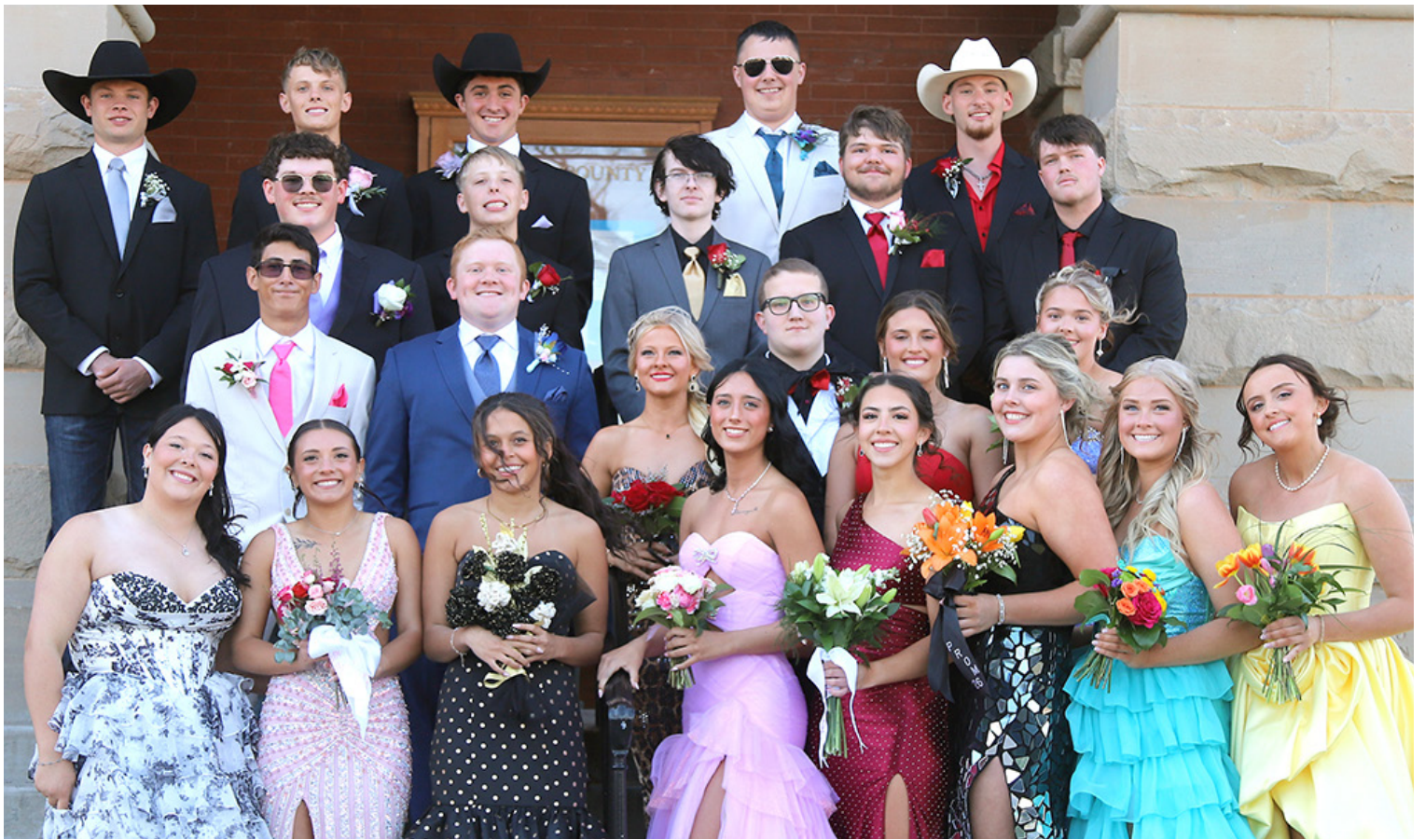
Clarendon Class of 2026 - Promenade