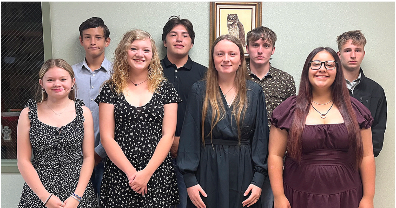
2025 Hedley Homecoming Court