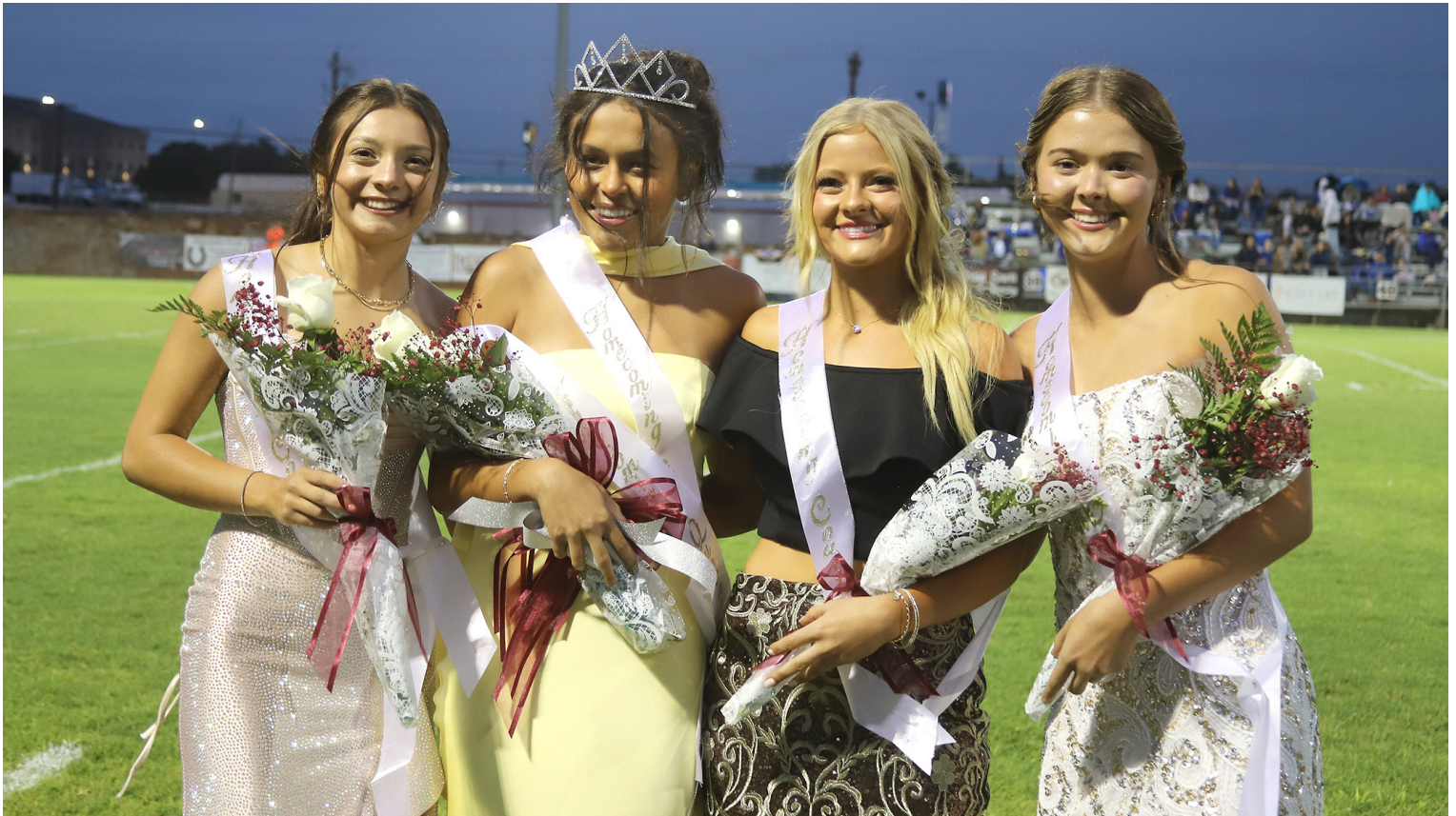
2025 Clarendon Homecoming Court