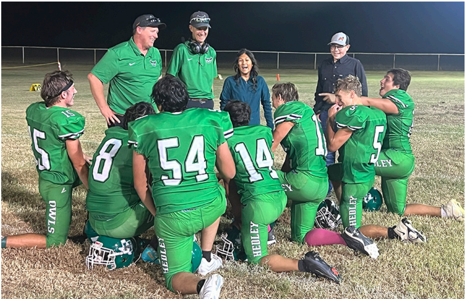
Hedley Homecoming Victory - 46-6 Over FFC Lions