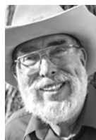
home country by slim randles

You might think that the older we get, the tougher our shells become to these little natural tragedies, but it doesn't seem to work that way. Maybe it's because we've now had children of our own, and grandchildren, too. Maybe that's why it actually hurts more to see a helpless baby bird today than when we